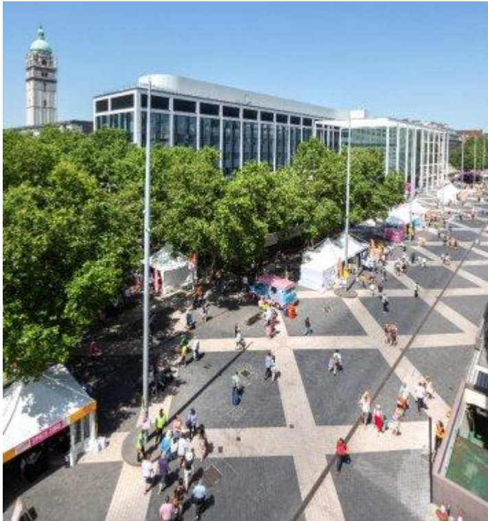
Aerial view of Exhibition Road during Great Exhibition Road Festival 2019.